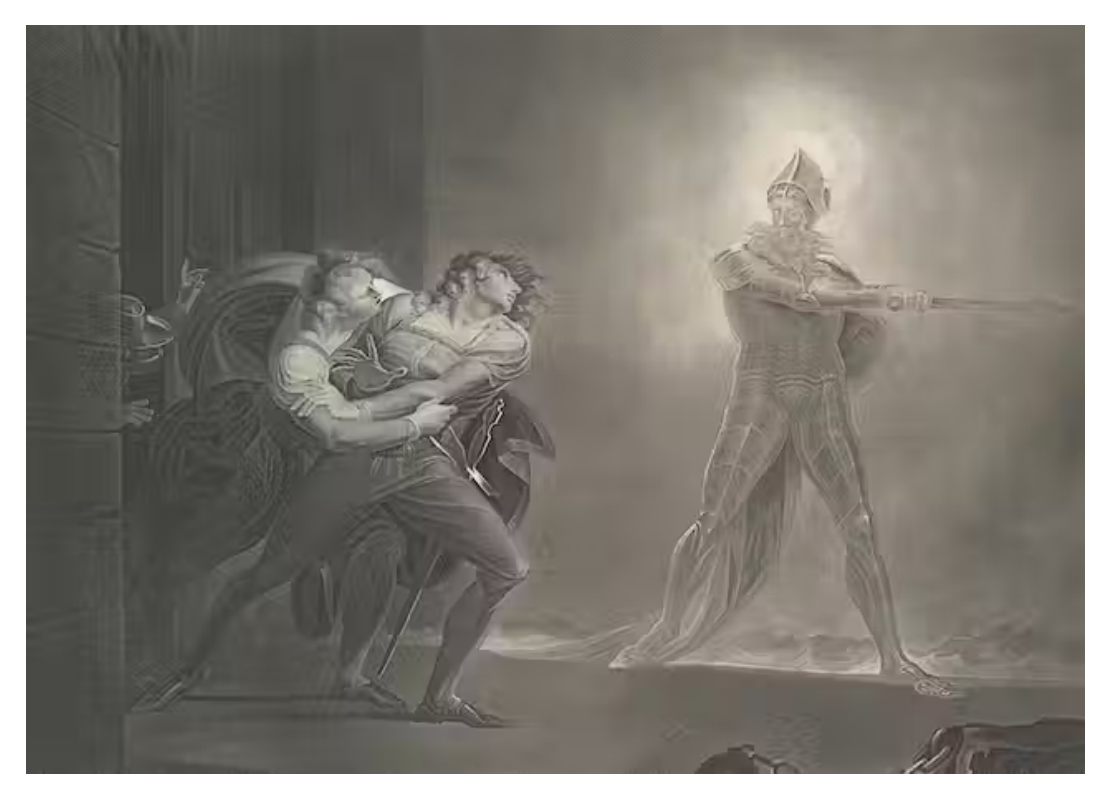
Hamlet, Act I, Scene 4 - Robert Thew and Henry Fuseli (1796).